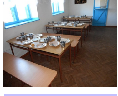
New desks for school cafeteria

On behalf of our children, parents and entire educational personnel, I would like to express our thanks to WHI for their efforts to assist us with the purchase of the tables and chairs for the school cafeteria. We would like to let you know that at the present time the new tables and chairs will be used to feed 84 elemenschool children tary (grades 1-4) and the new furniture is of a much higher quality compared with the old and it is much more comfortable for the stu-