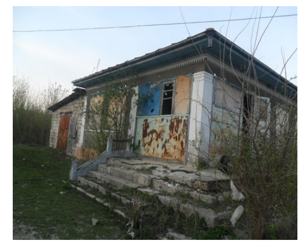
Building that was purchased for the center.

The community kitchen will be used to prepare and serve meals for three categories of individuals: the elderly who don't have any relatives and are encountering difficulties in satisfying their basic needs. (31 individuals); individuals with disabilities (72 individuals with various degrees and types of disability); children from low income families and families at risk (57 children)