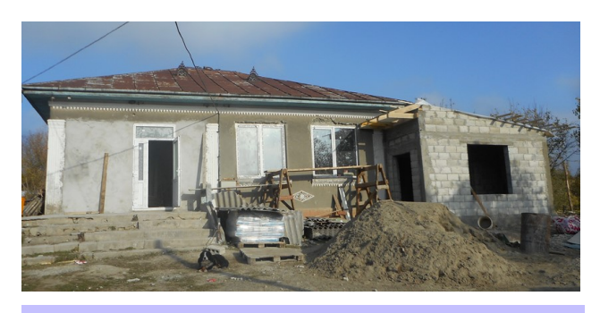
Addition Finished and New Windows and Doors Installed

NEED: At the present time there is a need to purchase various school supplies for the students to engage in various educational activities and to hire a teacher.