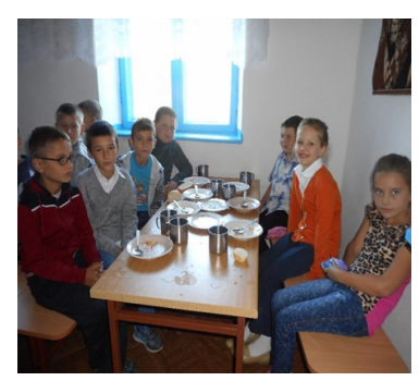
Elementary students at lunch

dents. Thank you again for this donation and for all the previous donations that have contributed to the improvement of the learning conditions of our students.