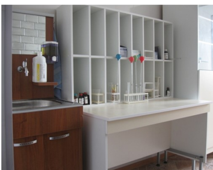
New furniture for health care center

The Health Center in the village of Cobani offers a variety of medical services to about 5000 patients from five surrounding villages. As with the majority of healthcare establishments in Moldova, the health center has encountered many difficulties in providing quality services to its patients during the past 20 years. Limited government funding and limited ability to pay by the patients has led many healthcare establishments to deliver substandard care. That's where WHI has come to play an important role in the improvement of the delivery of healthcare in the village of Cobani.